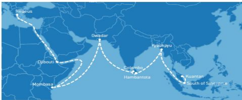
Figure 3: Key Port Cities of 21 st century Maritime Silk Road

BRI initiative also connects eight key ports of the member countries under 21 st century Maritime Silk Road. Those are: 1) Kuantan (Malaysia); 2) Kyaukpyu (Myanmar); 3) Jakarta and Batam Island (Indonesia); 4) Colombo and Hambantota (Sri Lanka); 5) Gwadar (Pakistan); 6) Djibouti (near red sea); 7) Mombasa (Kenya) and 8) Piraeus (Greece).